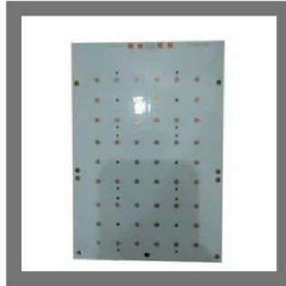
Printing Circuit Board