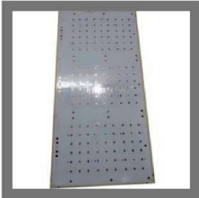
Metal Core Printed Circuit Board