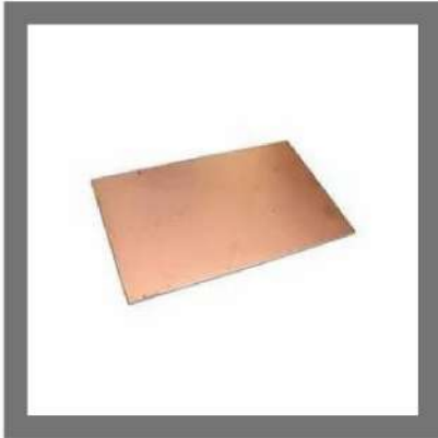
Copper Clad PCB