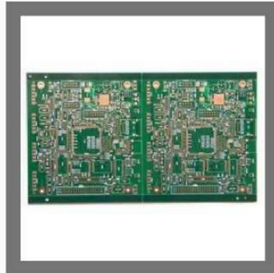
Single Sided Circuit Boards