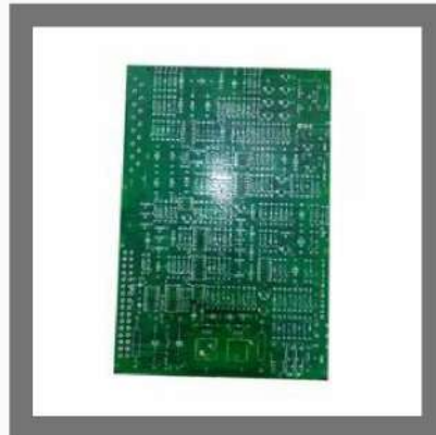
UPS Printing Circuit Board