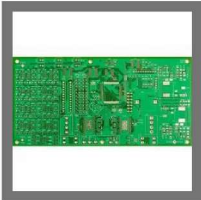
Metal Core Printed Circuit Board