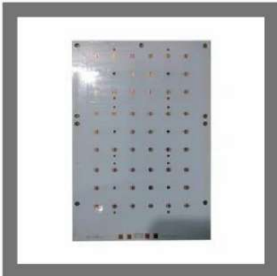
16 MM Metal Core PCB