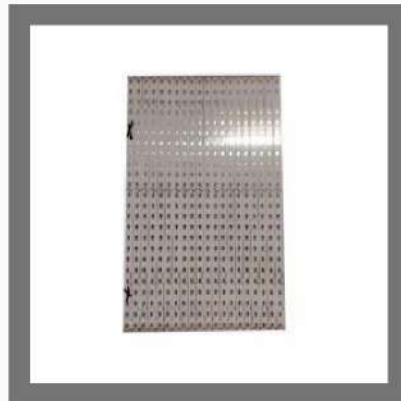
High Frequency MCPBC