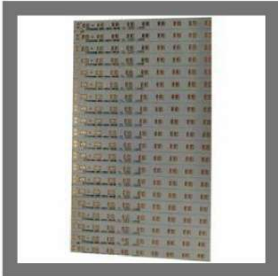
MCPCB LED Tube SMD Module